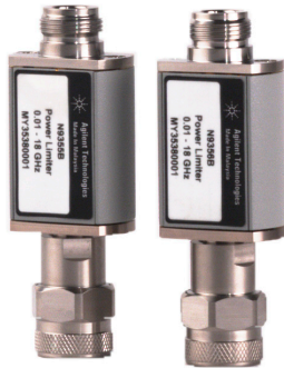
N9355B & N9356B