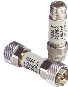
11930A & 11930B